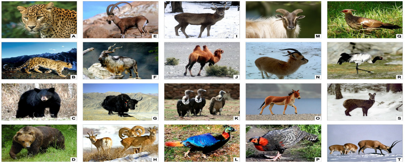
A Panthera pardus B Panthera uncia C Selenarctos thibetanus D Ursus arctos isabellinus E Capra ibex F Capra falconeri G Bos grunniens H Ovis vignei vignei I Cervus elaphus hanglu J Camelus bactrianus K Gyps bengalensis L Lophophorus impejanus M Hemitragus jemlahicus N Procapra picticaudata O Equus kiang P Tragopan melanocephalus Q Catreus wallichii R Grus nigricollis S Moschus moschiferus T Pantholops hodgsonii